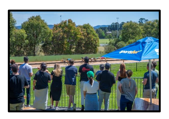
On Course Events.